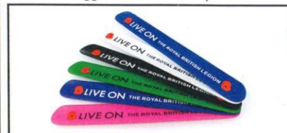
Snap Band - Suggested Donation: £1.00