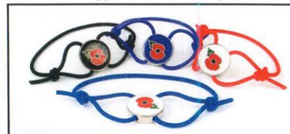
Friendship Bracelet - Suggested Donation: £1.00