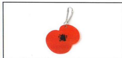
Reflector - Suggested Donation: 50p