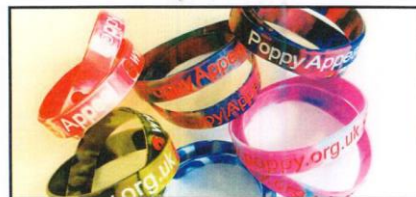
Wristband - Suggested Donation: 50p